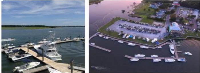
Where The Road Ends... The Fun Begins!

DIRECTIONS for GPS by Land Cruiser: 1800 Village Point Road, Shallotte, NC