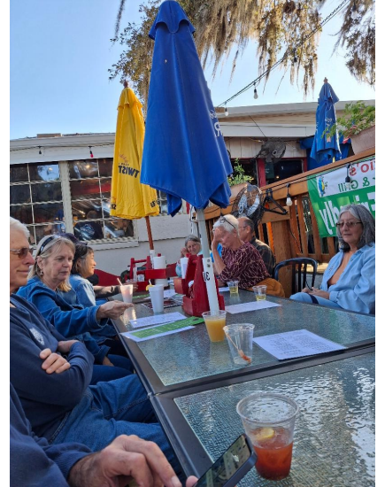
LUNCH WITH SHALLOTTE RIVER PS INLET VIEW RESTAURANT