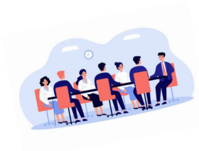
MAY 14 MEMBERS MEETING SUN COLONY CLUBHOUSE