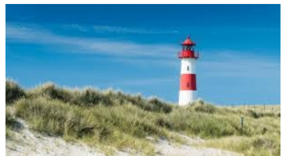
NATIONAL LIGHTHOUSE DAY AUGUST 7, 2025