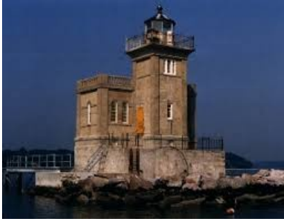
Huntington, SC Lighthouse

The Huntington Lighthouse Preservation Society (HLPS) is marking its 40th anniversary this year with expanded public tours, a new website and ongoing renovation efforts to maintain the 113-year-old landmark.