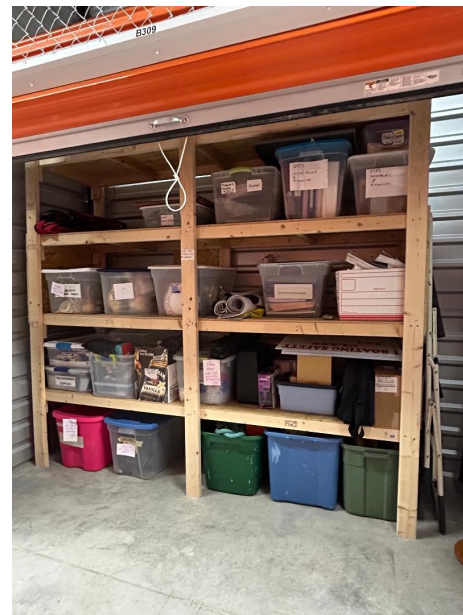
Our new home