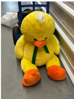
Off to greener pastures